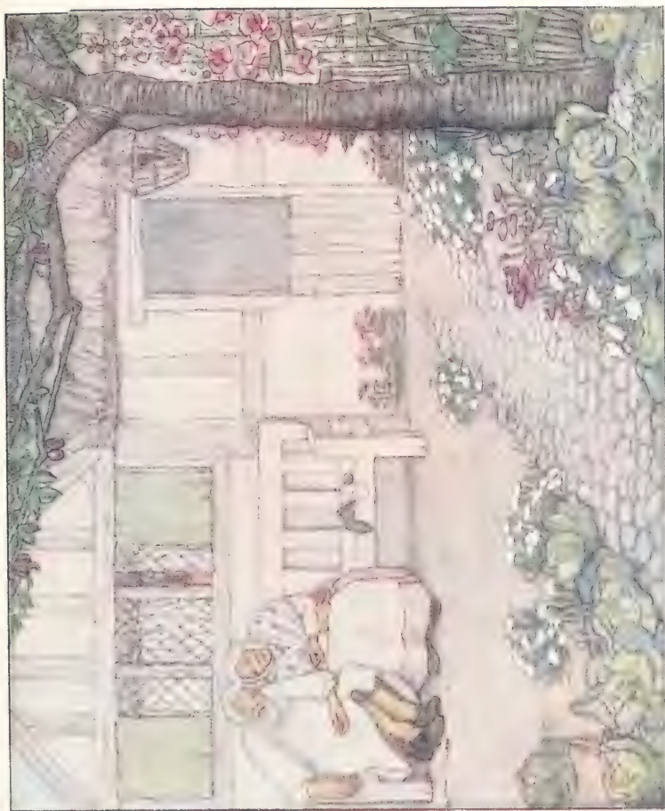
THE LAND OF MEMORY